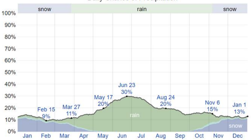
Daily Chance of Precipitation

The percentage of days in which various types of precipitation are observed, excluding trace quantities: rain alone, snow alone, and mixed (both rain and snow fell in the same day).